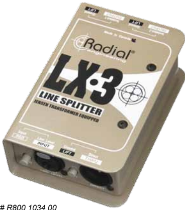
LX-3 Order # R800 1034 00

The Radial LX-3 is a passive balanced line-level splitter that allows you to send one audio signal to three destinations easily and without noise. It comes equipped with a premium Jensen JT-123-FLPCH transformer, which boasts a wide bandwidth, extremely low distortion, and the ability to handle high output signals with ease. It provides two 100% isolated outputs to eliminate hum and buzz from ground loops, along with a third direct output. All three XLR outputs have ground lift switches for additional noise suppression, and an XLR/TRS combo jack input provides the option for balanced or unbalanced inputs. The LX-3 is built for maximum durability with 14-gauge construction and can be mounted in a Radial J-Rak™, allowing up to 8 LX-3's to be rack-mounted together in a 2RU rack space. Typical applications include splitting the signal in the studio to send to multiple effects, feeding a console output to a number of recording devices, or even splitting a signal on a live stage to multiple monitors or headphone mixers. The LX-3 provides uncompromising audio quality to distribute your signal to multiple destinations with ease.